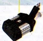
Black & Decker 100 Watt Power Inverter

If heavy flooding is imminent, turning off your electricity and water—to avoid contamination as sewers and other systems overflow, and to prevent a submerged basement from becoming electrified—is a risk-reducing procedure. Natural gas, on the other hand, should only be shut off when authorities advise it. Although a simple wrench or pliers will adjust most gas and water valves, the On Duty 4-in-1 Emergency Tool ($17) is designed to quickly handle both. If you do turn off the gas, never turn it back on yourself—your utility company has a better chance of spotting damaged lines.